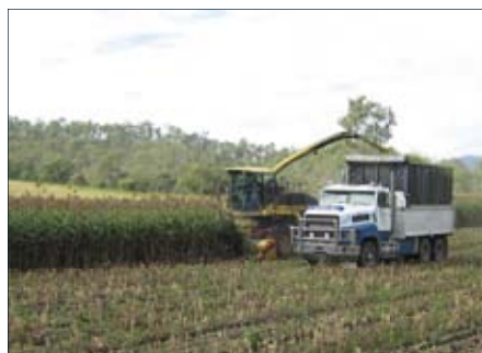
Wet soil responds quicker after compaction by machinery.

Prior to using NatraMin, we often had to burn the excess stubble and cultivate the puggy black soil up to six times to prepare a seedbed. This soil was like black shiny boot polish to work, but now its physical appearance and colour has changed with improved structure and more organic matter.”