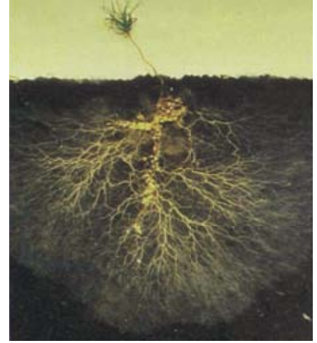
Above; A root system colonised by Mycorrhizal fungus. in a symbiotic relationship, the fungus dissolves nutrients in the soil and ferries them to the plant, in return for plant sugars.

In a similar fashion, nitrogen fixing bacteria are 'switched-off' by high levels of free nitrate nitrogen, shutting down the pathway plants use naturally to access nitrogen.